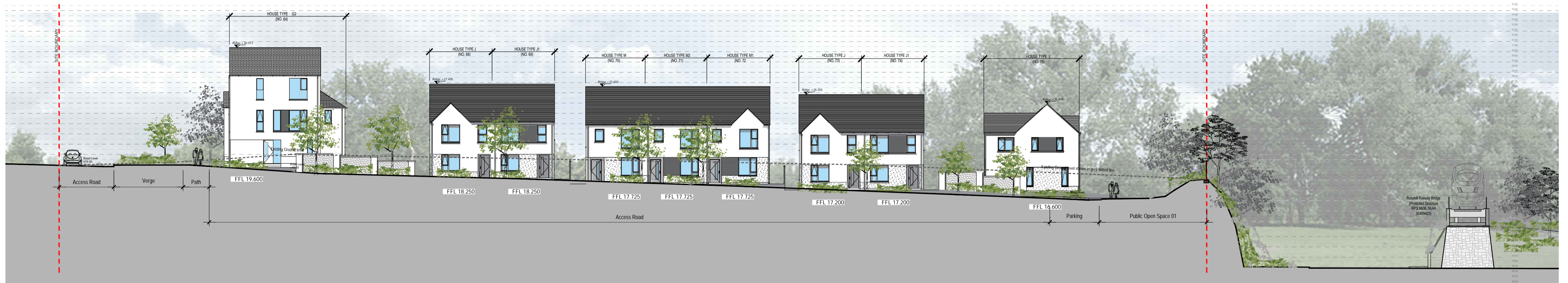
02 Site Context Elevation C-C Part 1 Scale: 1:200